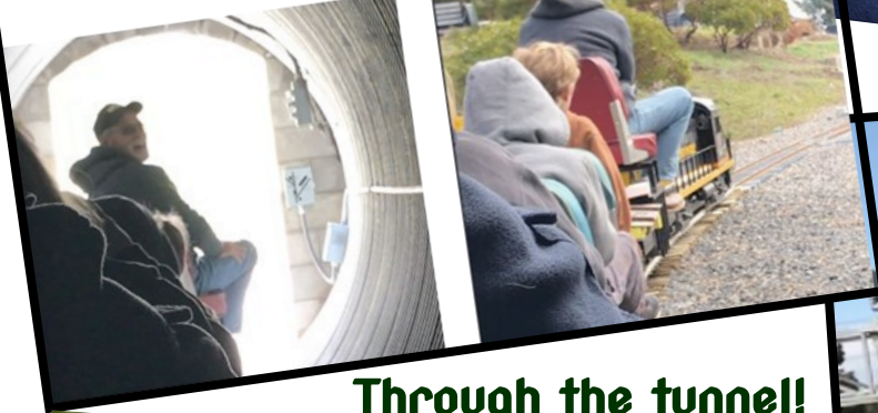
Through the tunnel!