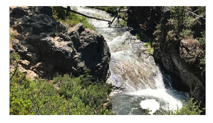
Continue hiking up the main trail to the spur that takes you down to the creek.

The slide area is unsigned. Here's the upper water slide from the trail. You can see the steep trail down to the pool and beach area to its left.