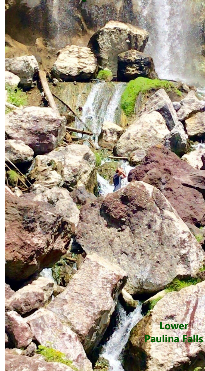
Lower Paulina Falls