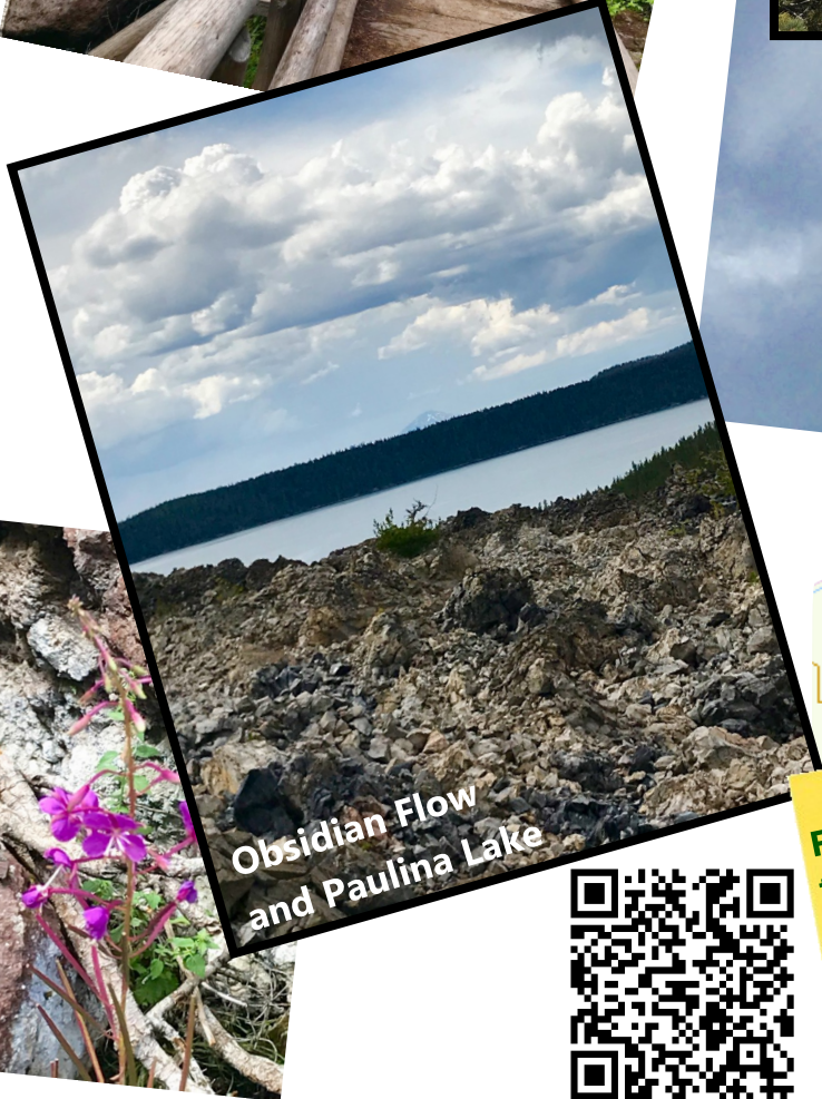
Obsidian Flow and Paulina Lake